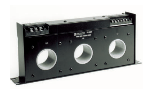
Three Phase Power to 1000HP