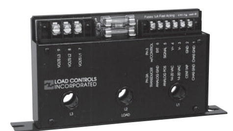
Three Phase Power to 150HP